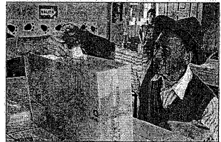
A man votes in Peru.

In a direct democracy , there are no representatives. Citizens are directly involved in the day-to-day work of governing the country. Citizens might be required to participate in lawmaking or act as judges, for example. The best example of this was in the ancient Greek city-state called Athens. Most modern countries are too large for a direct democracy to work.