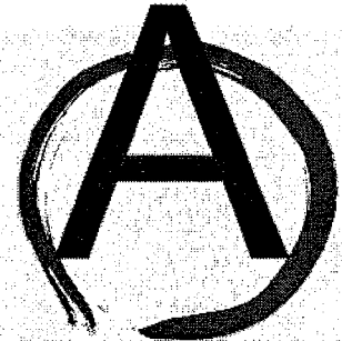
An A inside a circle is the traditional symbol for anarchy.

In an anarchy , nobody is in control—or everyone is, depending on how you look at it. Sometimes the word anarchy is used to refer to an out-of-control mob. When it comes to government, anarchy would be one way to describe the human state of existence before any governments developed. It would be similar to the way animals live in the wild, with everyone looking out for themselves. Today, people who call themselves anarchists usually believe that people should be allowed to freely associate together without being subject to any nation or government. There are no countries that have anarchy as their form of government.