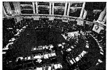
The Peruvian legislature