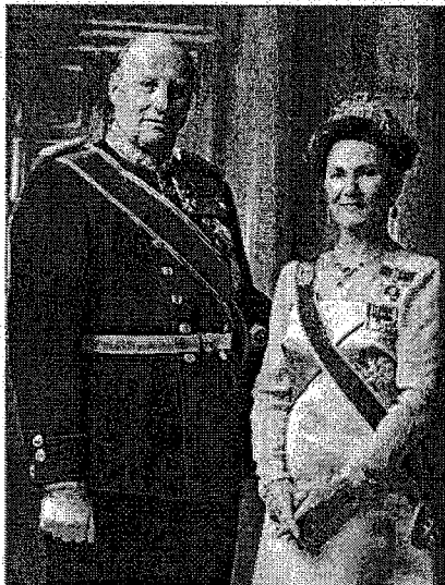
King Harald V of Norway with his wife, Queen Sonja. Norway is a constitutional monarchy. The king is the head of state and has a mainly ceremonial role. The actual government is a democracy.